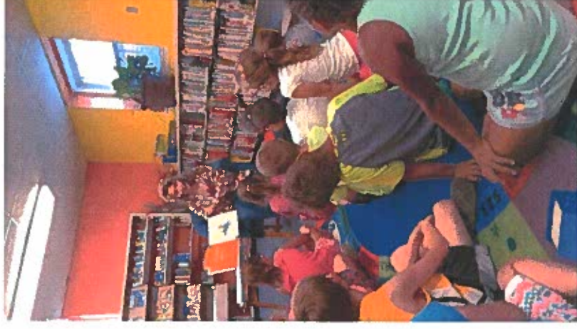
The boys and girls enjoyed their visit to the Ogdensburg Public Library!