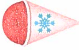
The ice cream and sno-cones were great too!