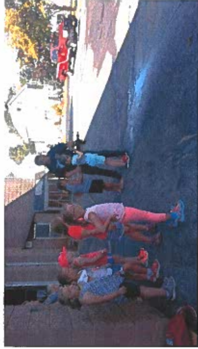
The students had a fun (and wet) trip to the Ogdensburg Fire Department!