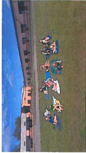
Water Fun Day at Kennedy School, courtesy of the Ogdensburg Fire Department, was a blast!