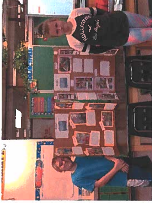
Students researched different types of bridges and then shared their findings with their classmates.