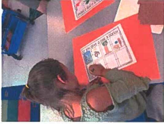
Teachers worked with students to review English Language Arts (ELA) curriculum.