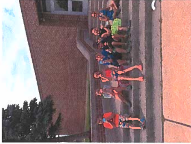
Water Fun Day at Madill School, courtesy of the Ogdensburg Fire Department, was awesome!